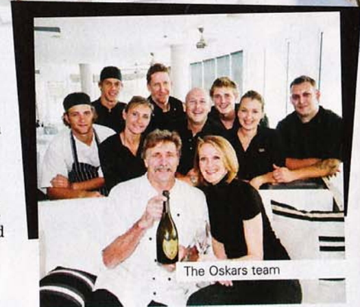
The Oskars team